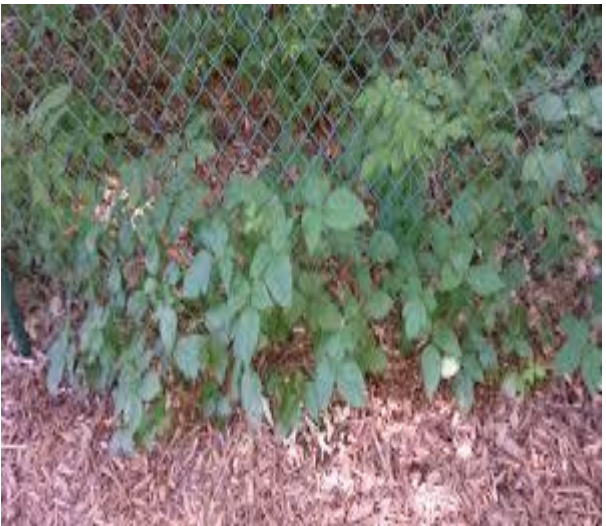
Four examples below of vegetation contacting a fence or building that is NOT acceptable and is a defect.