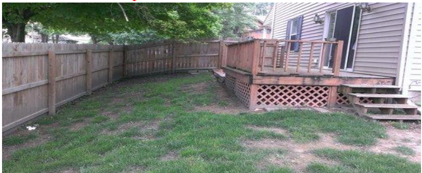
Here are three examples of what is NOT erosion:

Often inspectors record a defect for erosion because the area under a tree or path that residence use does not have grass growing on it. This is not correct. Erosion shall be evaluated only if there is evidence of displaced soil.